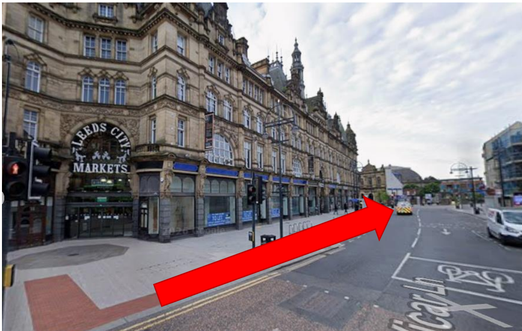
Go past Leeds city Market