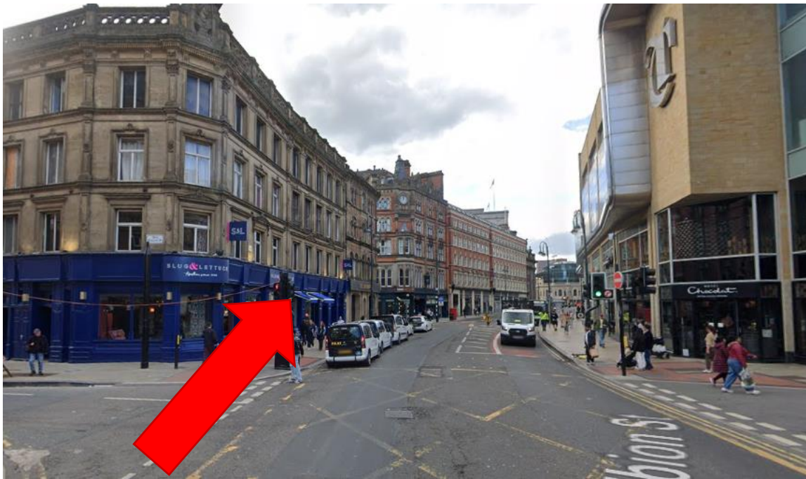
When you get to the Junction with New Station & Albion Street cross over new station street when green man and continue straight onto Boar Lane