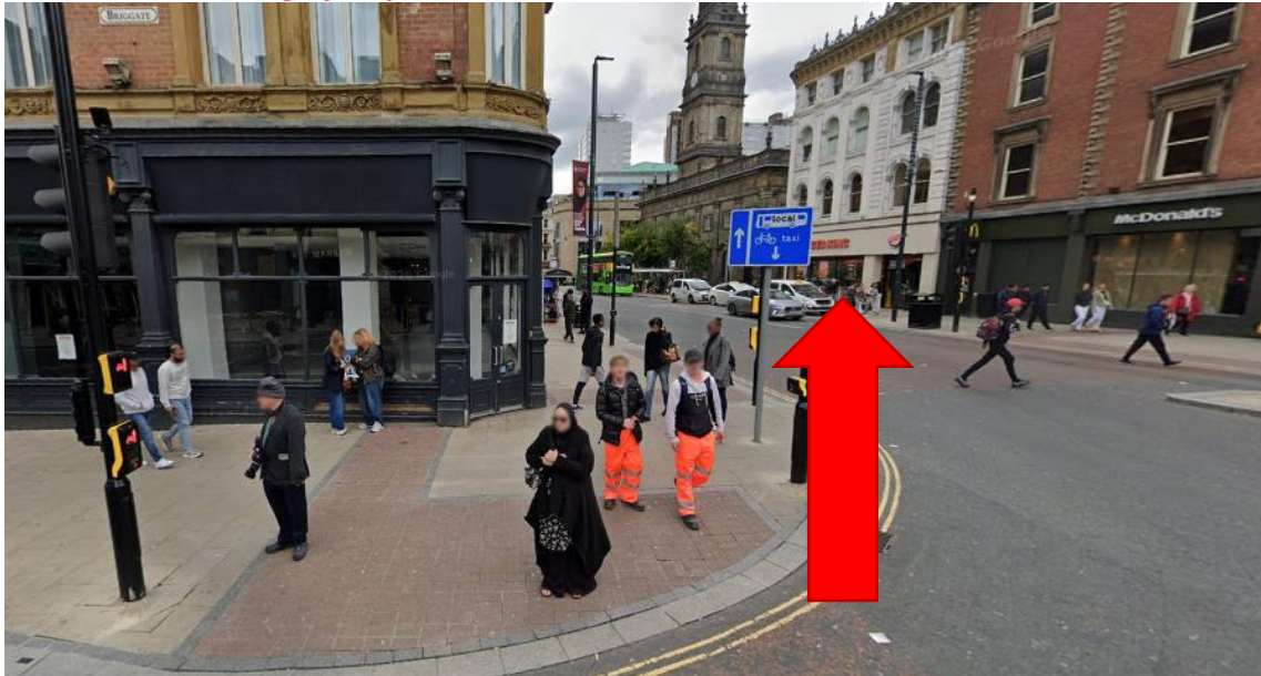
Continue straight onto Boar Lane