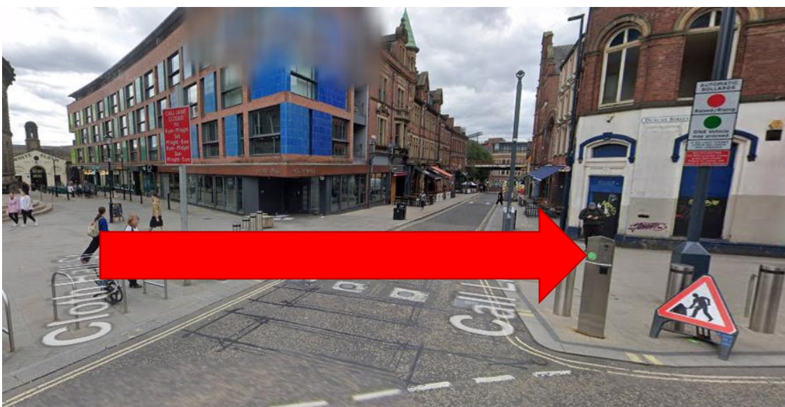
When pass the corn exchange use this crossing to head right on to Duncan Street and continue forward.