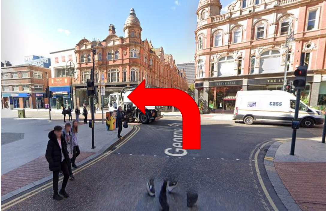
When you reach the end turn left onto Vicar Lane.