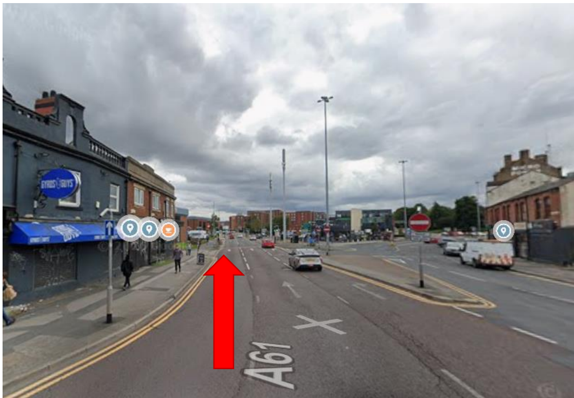
Head straight until 'Howdens' is on your left and the crossing is on your right.