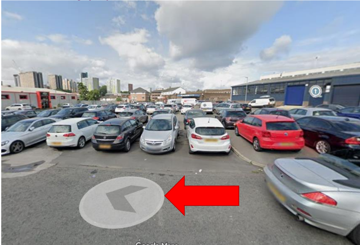
Walk out of the Advonet building and turn left.