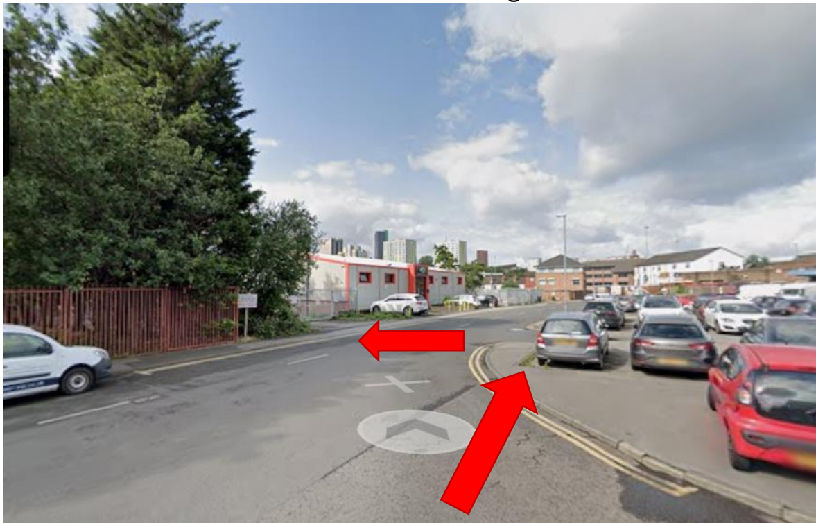
Cross over safely over the road in front, then to the left.