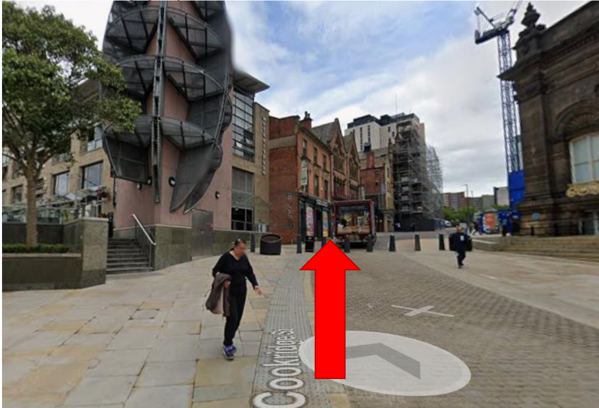
Go past Millenium square and the city museum