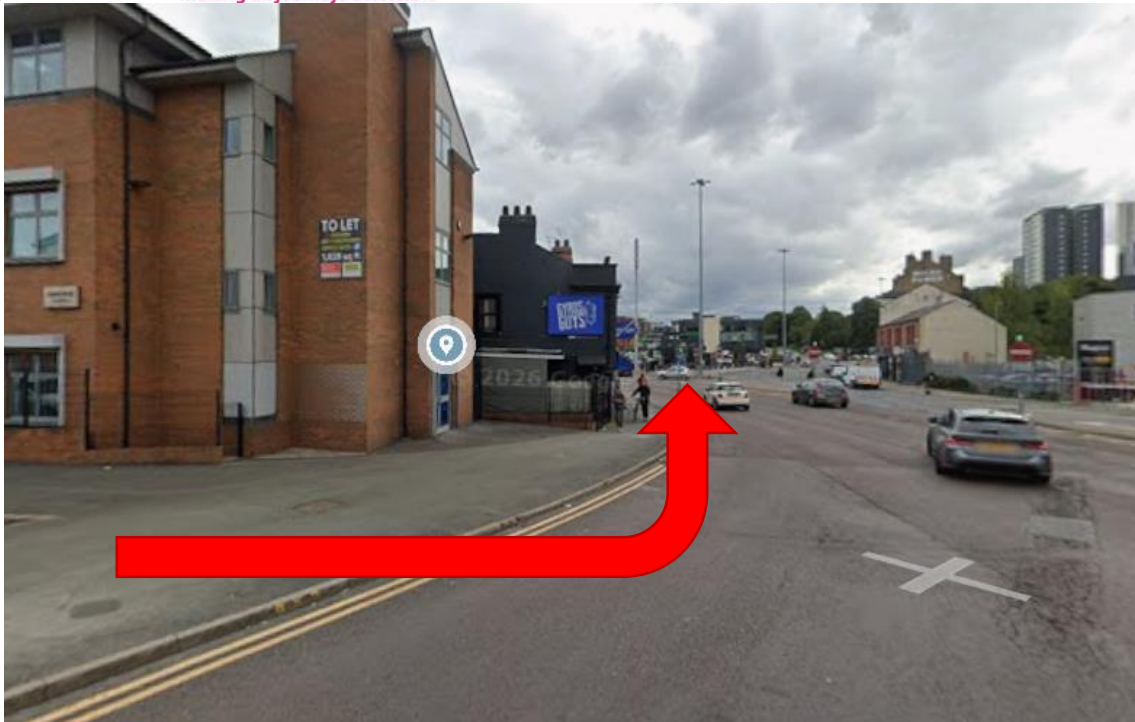
After turning left, go past the sign 'gyros guys', head to the crossing.