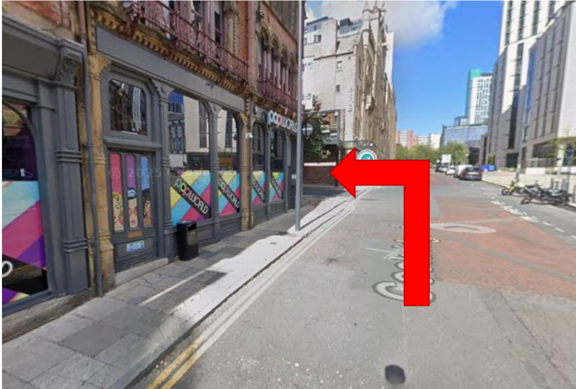
Go passed Popworld and turn left.